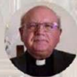
Archbishop Domenico Sorrentino Archbishop of Assisi